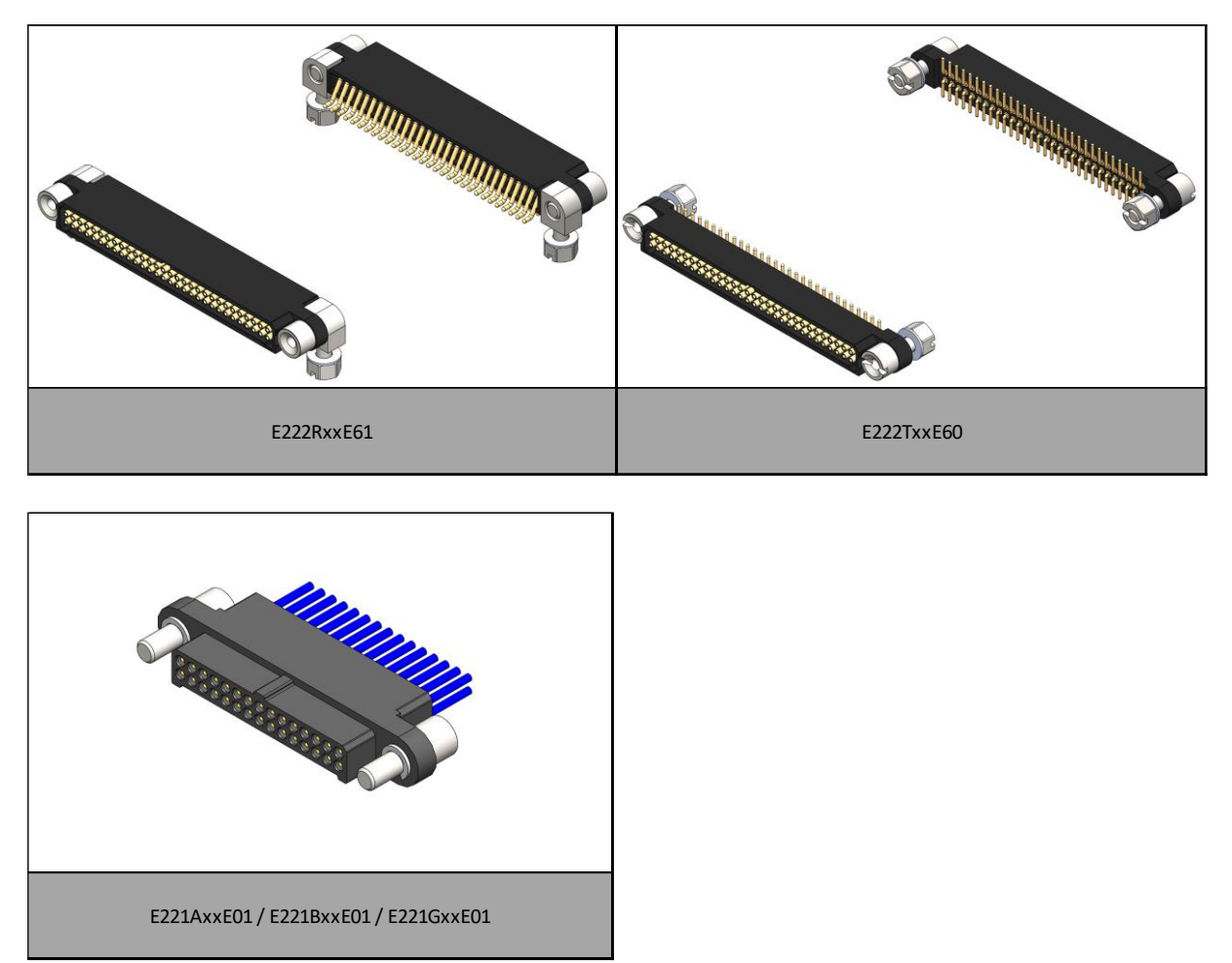
E221GxxE01 is the new codification for connectors qualified with codification E221CxxE01